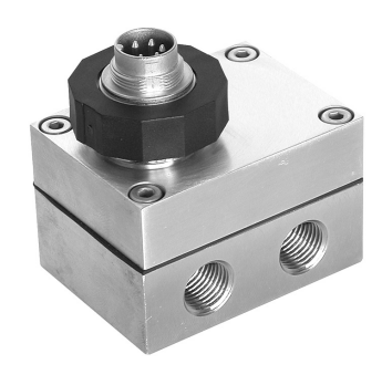
Low Pressure Version

So that the differential pressure can also be measured exactly if the standard pressure range/ differential pressure ratio is high, this series also features the tried-and-tested microprocessor-based technology that is used in Series 30 X. All reproducible pressure sensor errors (i.e. non-linearities and temperature dependencies) are entirely eliminated thanks to mathematical error compensation. The sensor signals are measured with a 16-bit A/D converter, so the individual standard pressure ranges can be measured to an accuracy of 0,05%FS throughout the entire pressure and temperature range.